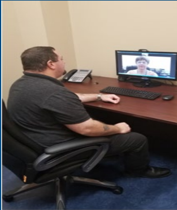
N. Ft. Myers (Primary OTP)

In order to accommodate the counseling requirements for patients who are unable or unwilling to routinely drive long distances to reach the primary OTP, we utilize behavioral telehealth.