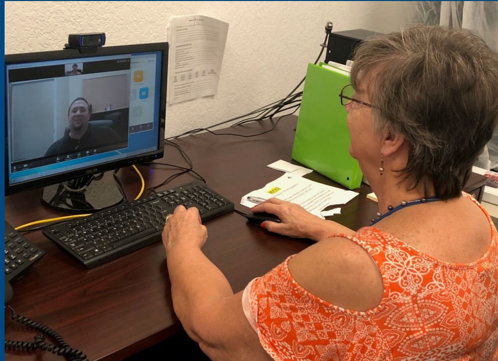
Port Charlotte (Satellite)